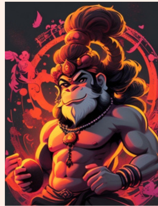
Play to Earn